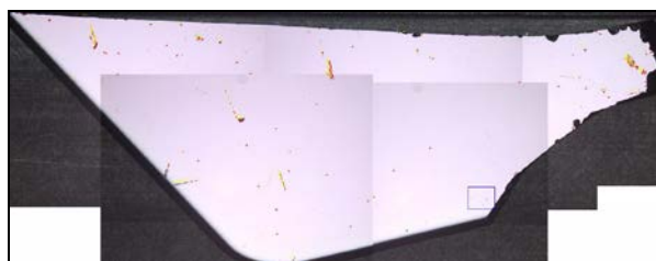
Fig. 1. Sample 60326. Features present at the time of allocation are in yellow. Features present after PI return are in red. The area bounded by the square was scanned at higher magnification (position 1).

Sample 60326: Flown sample 60326 is a silicon-on sapphire (SOS) layered fragment from the bulk-array. It is 22.7 x 9.3 mm in one dimension and has a thickness of 706 \mu\text{m} . The sample has been UPW and exposed to UV ozone cleaning at JSC. It has also had an additional surface cleaning in an HCl bath (Caltech). This sample did not have the benefit of high magnification scanning before its allocation in 2007, but its return to JSC in 2011 provided an opportunity to document the sample surface as part of this cleaning study effort. An overview scan (Fig.1) shows that small features were subsequently added to the sample surface.